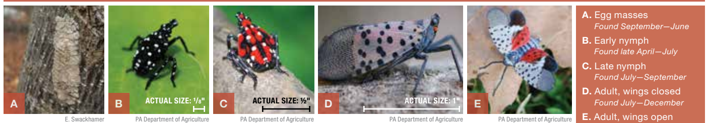
Figure 1. The life stages of SLF, including an egg mass on a tree.

dots and black stripes (Figure 1). SLF adults emerge in July and are active until winter. This is the most obvious and easily detectable stage because they are large (~1 inch) and highly mobile. Adults have black bodies with brightly colored wings. Only the adults can fly. Because SLF adults jump more than fly, their wings often remain closed. SLF wings are gray with black spots, and the tips of the wings are black with gray veins.