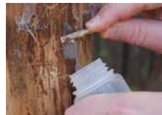
Figure 3. Scraping SLF egg masses from a tree.

Walk around your property to check for egg masses on trees, cement blocks, rocks, and any other hard surface. If you find egg masses on your property from September to May, you can scrape them off using a plastic card or putty knife (Figure 3). Scrape them into a bag or container filled with rubbing alcohol or hand sanitizer and keep them in this solution permanently. Egg masses can also be smashed or burned. Remember that some eggs will be laid at the tops of trees and may not be possible to reach.